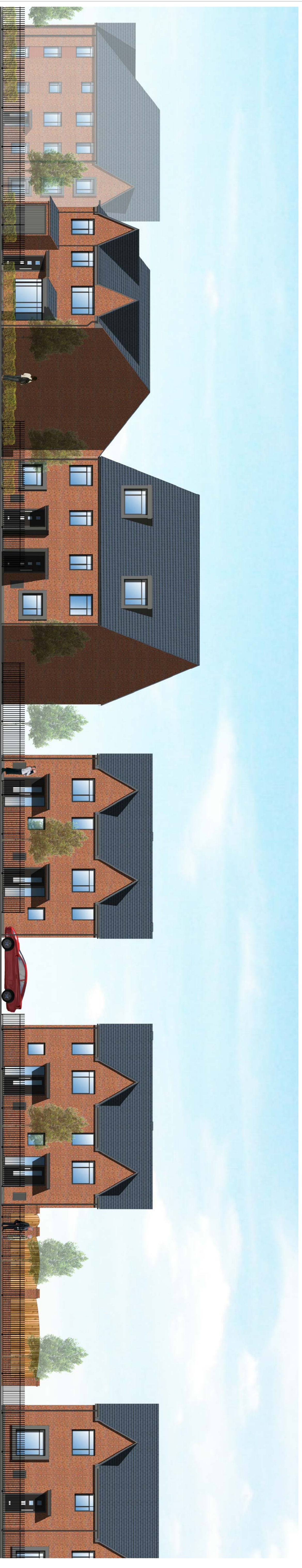
Street Elevation A - Looking at the development from Martin Street