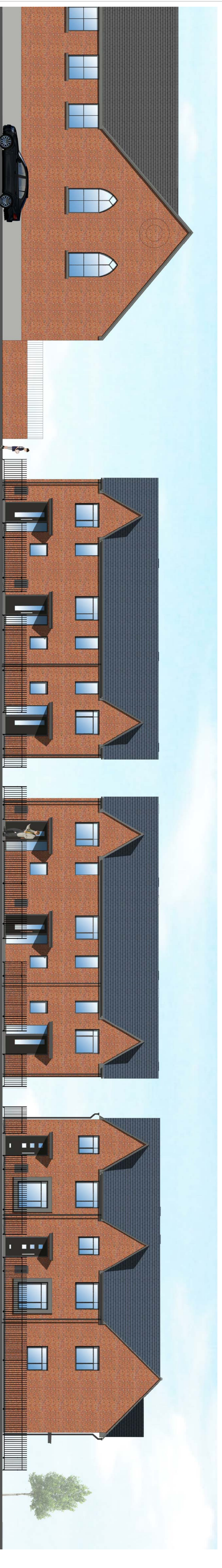
Street Elevation C - Looking at plots 166 - 177