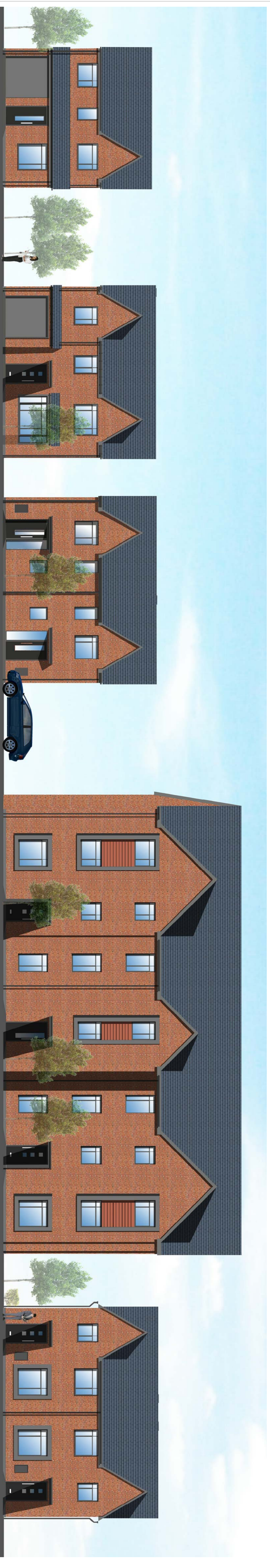
Street Elevation B - Looking at the development from Martin Street